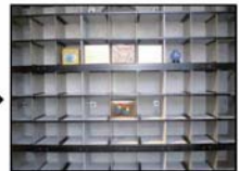
INSIDE THE COLUMBARIUM niches for placing cinerary urns or tubes holding cremated remains.