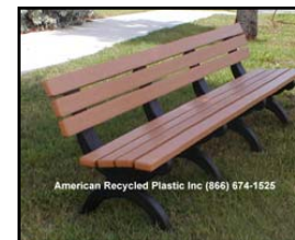
American Recycled Plastic Inc (866) 874-1525

Donations to the Columbarium and Memorial Garden capital and endowment funds are also being accepted. Any donation made to the Columbarium and Memorial Garden fund will be matched dollar for dollar up to a total of $10,000! All donations are tax deductible. The matching funds do not apply to purchases.