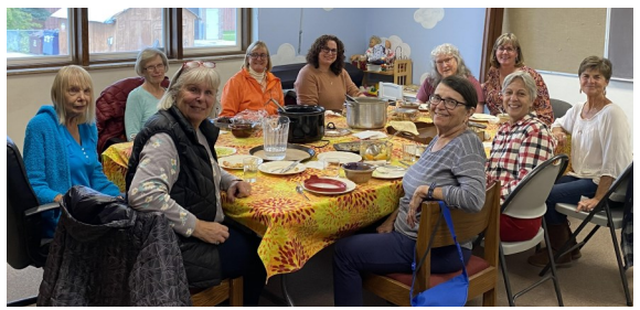
Ten attended the October Ladies' Lunch. Come and join the fun!